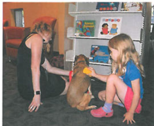
Petting and brushing one of the therapy dogs at ICPL's Autism Accessible Browsing Hour