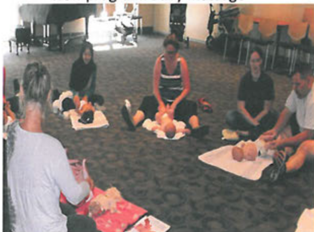
New program: Baby Massage