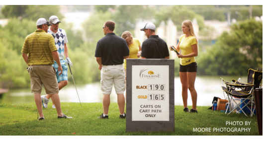
The Library Links Golf Tournament was held in June at Finkbine Golf Course.