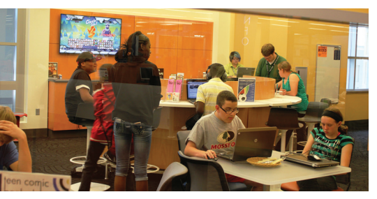
Teens enjoy the Koza Family Teen Center (above). The new interactive touch table in the Children's Room is a hit (below).